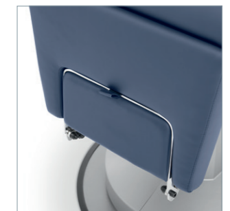
Foldable footrest, optically perfectly integrated into the leg section