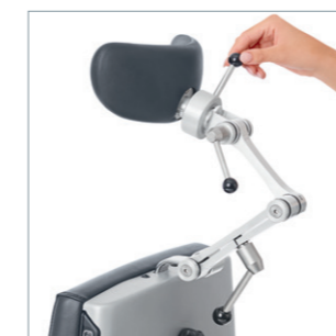
Any position can be fixed with the headrest Ergo, half or full dome