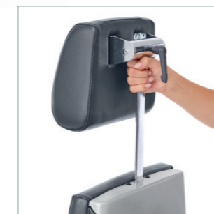
Ergo headrest as standard can be easily exchanged