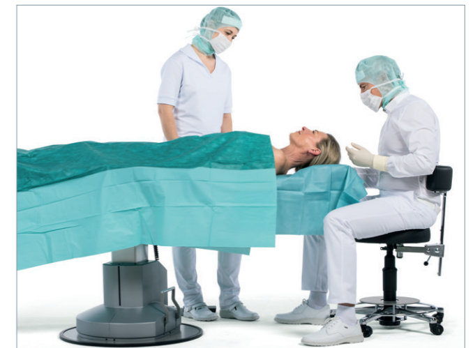
Treatment and surgery when reclined, sitting in the 12 o'clock position