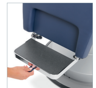
With synchronous adjustment, the step plate moves ergonomically