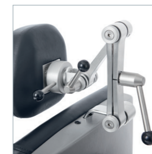
Use of the Vario double joint