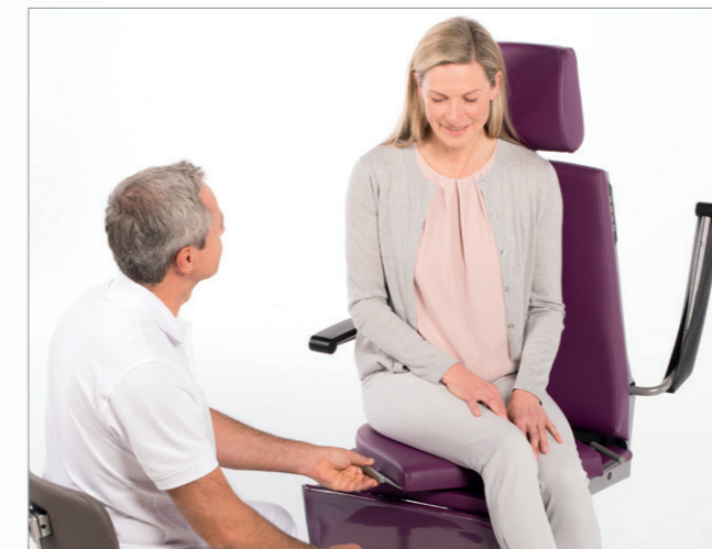
Seat can be rotated 90 ° to the right and left (option), can be locked in any position