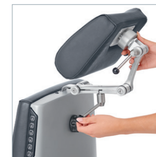
Quick and easy positioning – unique joint fixture